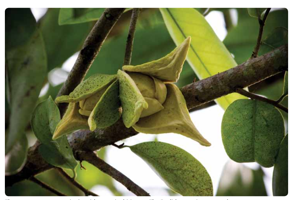
The annonna squamosa ; its Spanish name is chirimoya. The English name is sugar apple or sweetsop. The Mayan name is tsalmuy, and the Nahual name is poshte.