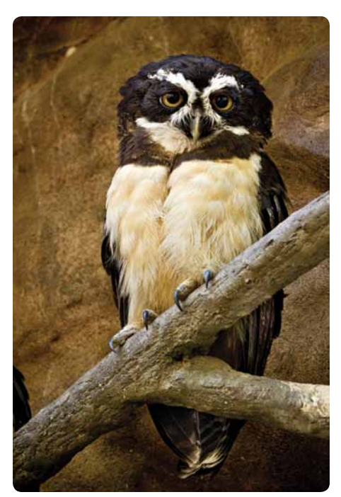
Pulsatrix perspicillata or spectacled owl, La Aurora Zoo, Guatemala

Mayan art, too, often depicts the owl. As birds of prey, they are characterized as nocturnal predators; their soft plumage is adapted to move silently at night. In the Mayan belief system, the night, the darkness and death are connected, so it isn't surprising that the owl has been associated with dark forces, as messengers of the underworld and as a manifestation of the god of death.