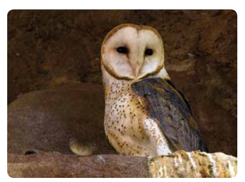
Tyto alba or barn owl, La Aurora Zoo, Guatemala