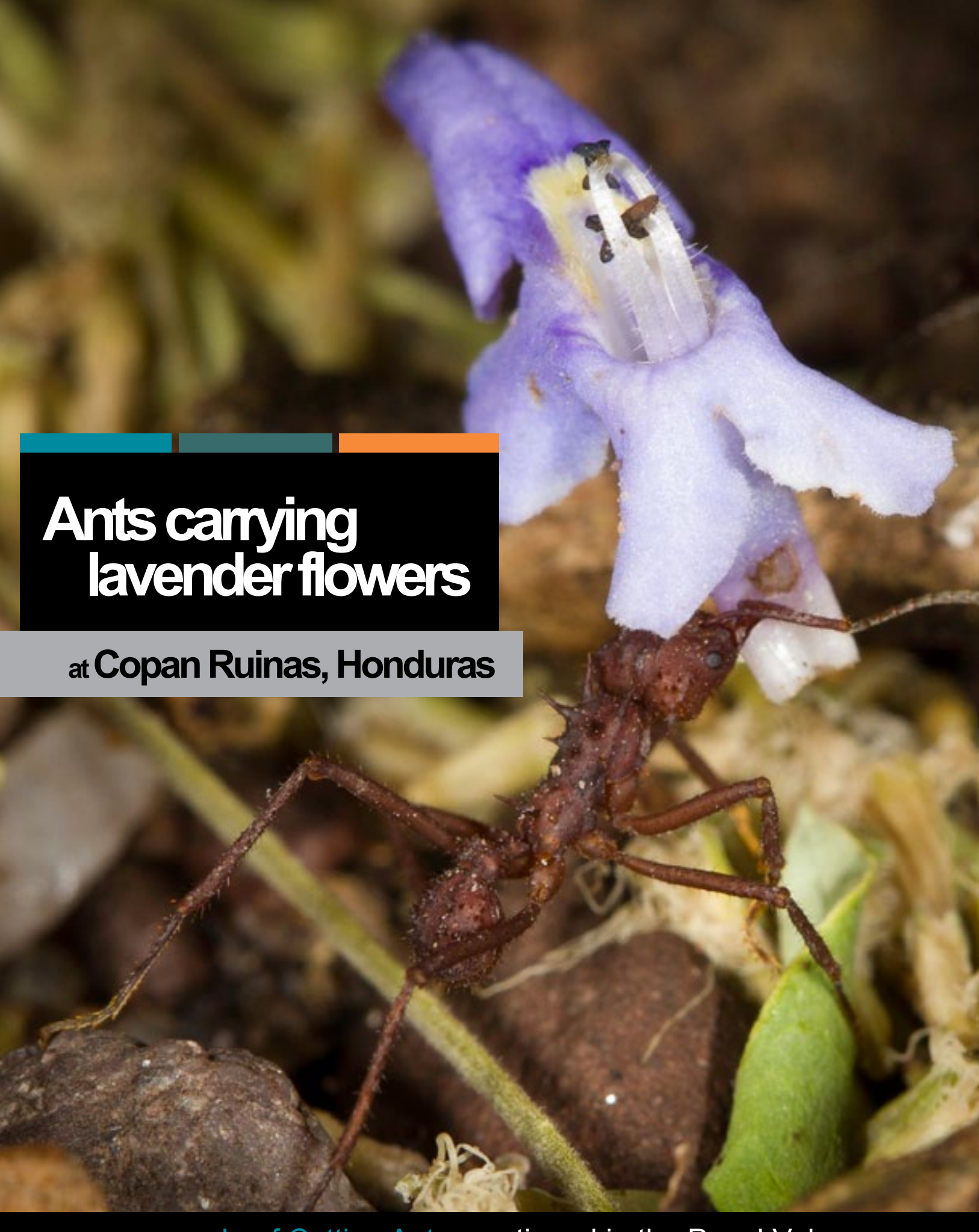
Leaf Cutting Ants mentioned in the Popol Vuh