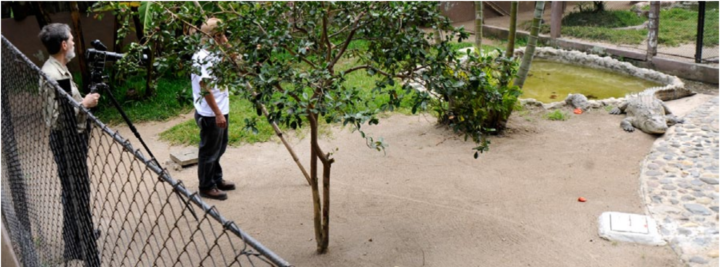
Figure 13. Note that Nicholas is standing as far away as possible. A fully grown crocodile can charge rapidly. It is important to watch how it breathes; breathing pattern will tell you when the crocodile is about to attack.