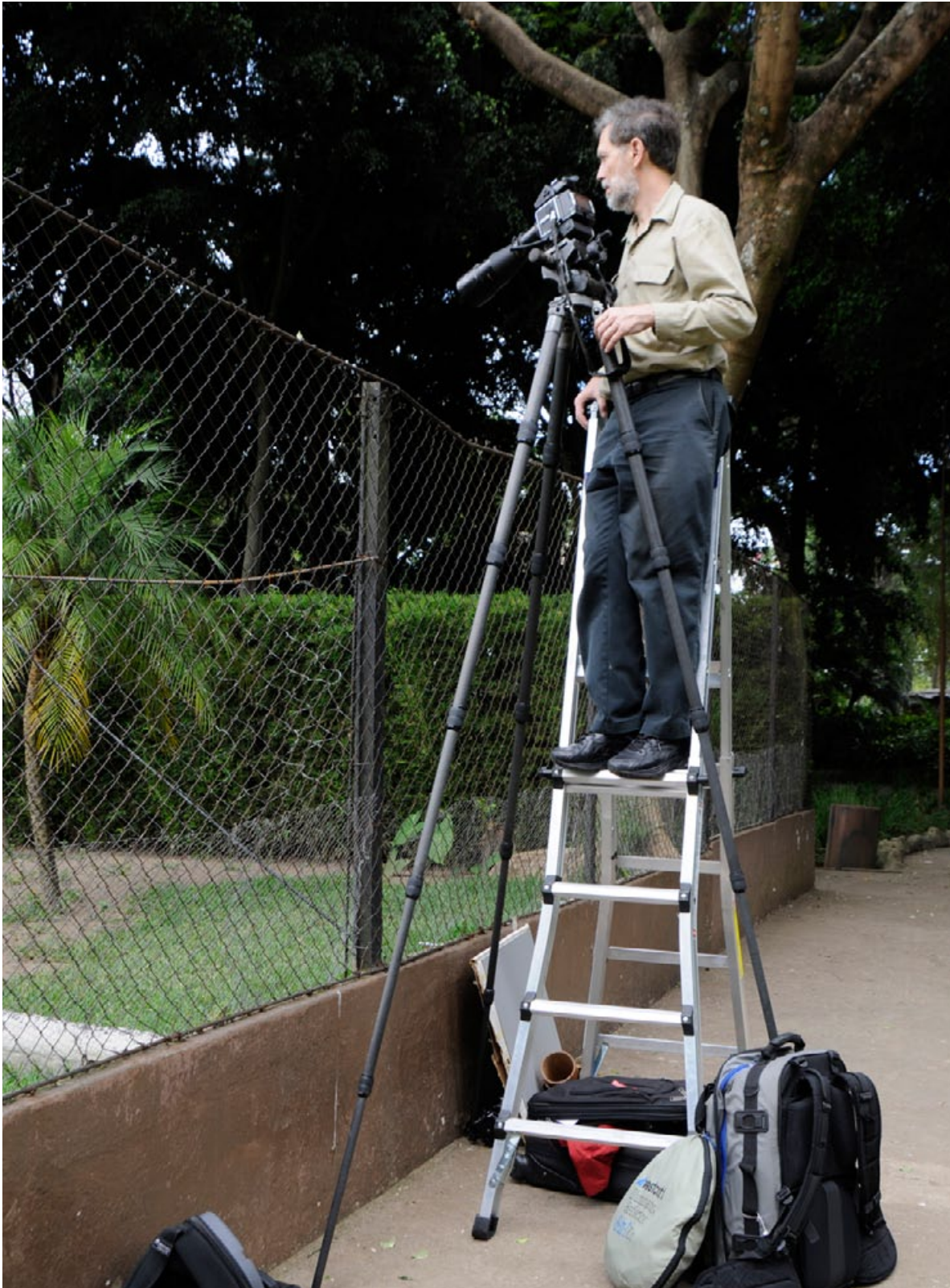
Figure 3. The Gitzo G1548GT tripod can be extended up more than 3 meters (actually up to well over 11 feet), it is a good option when you have a fence or a wall in front of you, and you can't focus on the object like in this situation. If you need to shoot over a fence or a wall, then you need a tripod that is this high (and which remains sturdy at this height also).