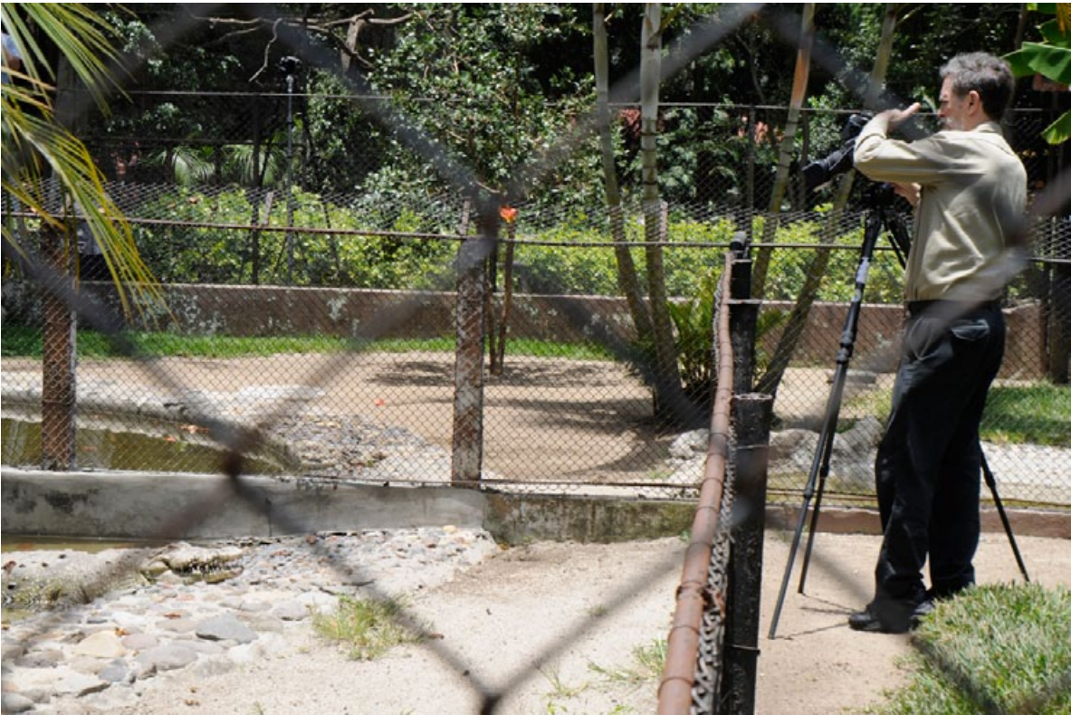
Figure 8. This photo show you Nicholas trying to focus the crocodile with the Hasselblad camera and Phase One P 25+ digital back using the Gitzo G2257 tripod.