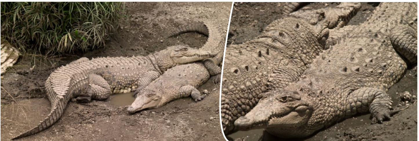
Figure 11. Here you can see the Cocodrilus moreletii . Nicholas Hellmuth took this photos at La Aurora Zoo in Guatemala city. He used a Hasselblad EXL medium format camera with Phase One P25+ digital back.