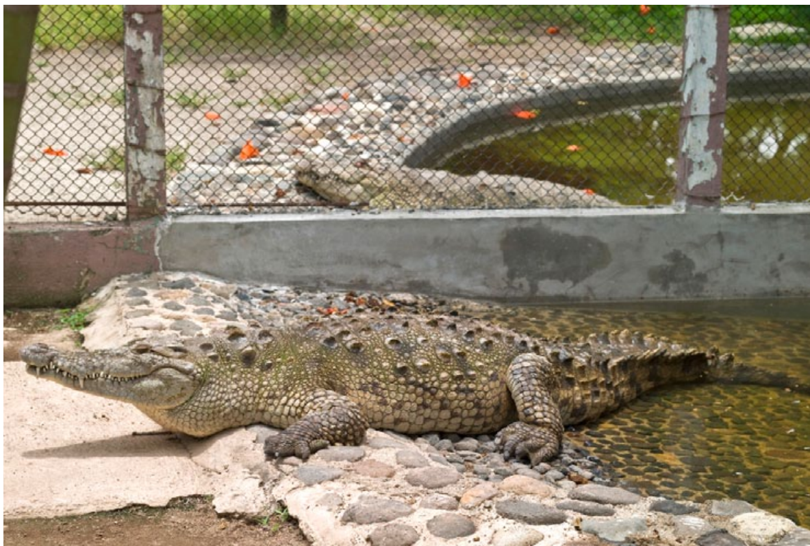
Figure 6. You can see the Cocodrilus acutus . This photo was taken with a Hasselblad medium format camera and Phase One P25+ digital back.