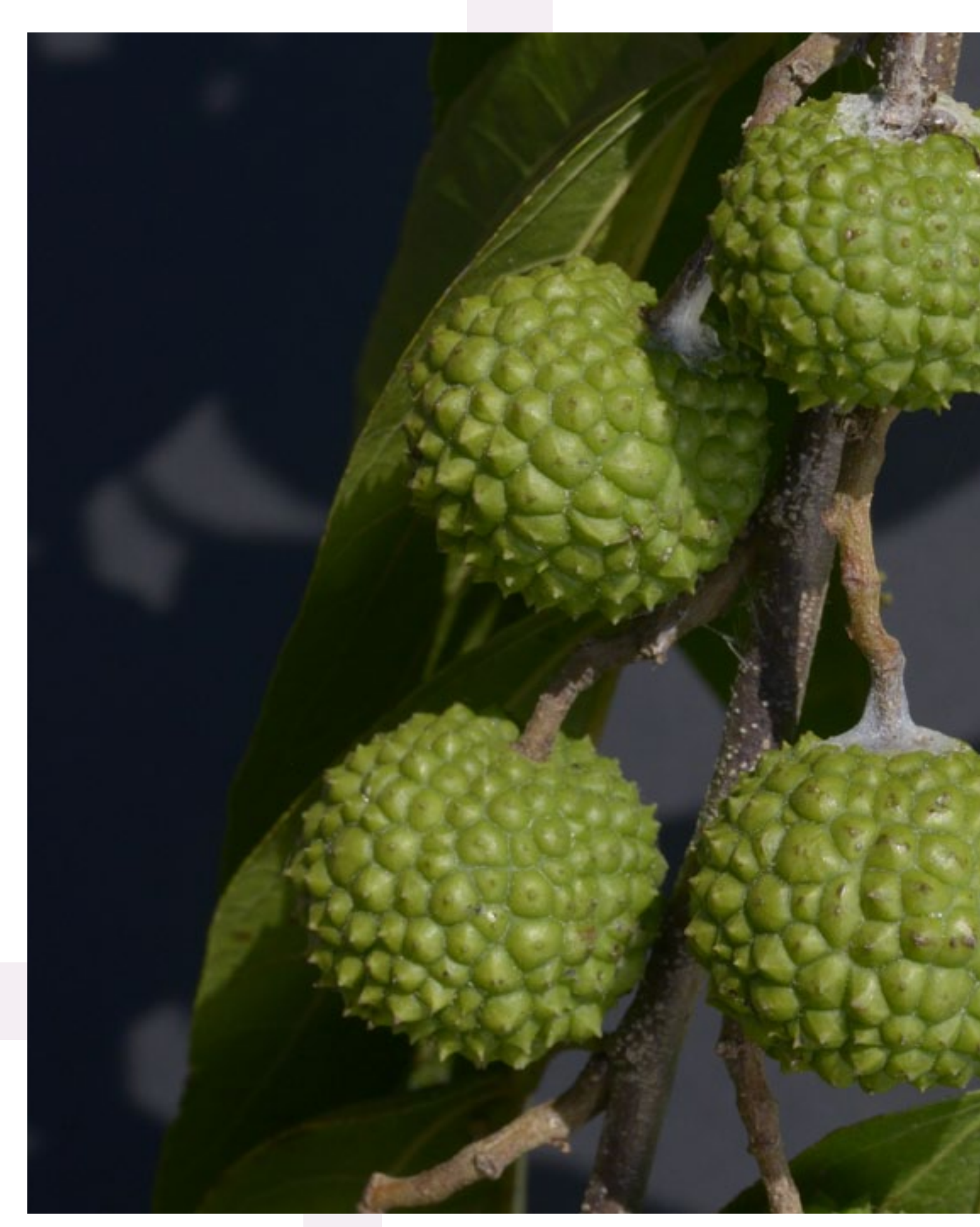
All the leaves usually drop off the tree, so you can easily see the fruits.